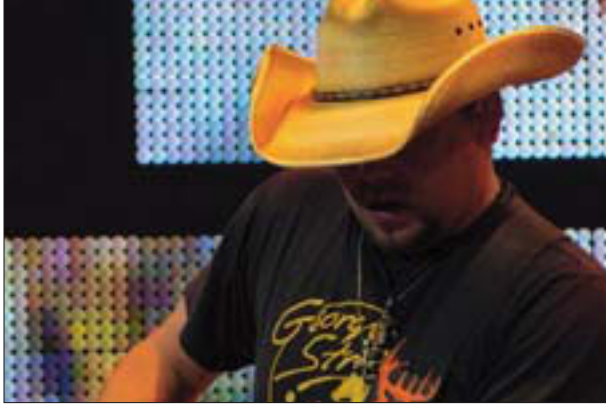
Breaking records: Jason Aldean's performance had a paid Rodeo attendance of 74,905, the largest Rodeo crowd in history.