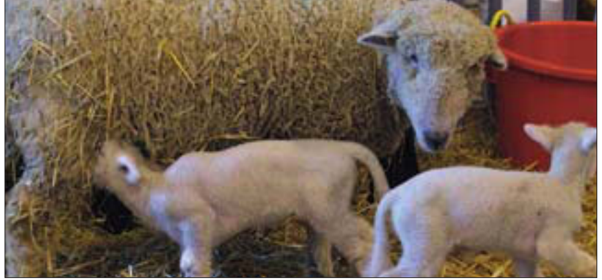
Baa-bies: In the Capital One Bank AGVENTURE Birthing Center, 26 lambs were born during the Show.