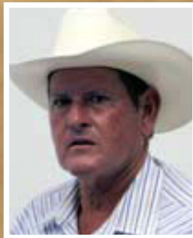
W.F. GONZALES All Breeds Livestock Sales