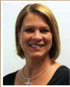
LORE CORDELL Events & Functions