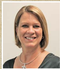
LORE CORDELL Events & Functions