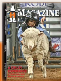
The Cover ... Mutton Bustin' was a popular new event for 2009 RODEOHOUSTON™.

Miss Rodeo Texas promotes rodeo, Western heritage, agriculture and philanthropy.