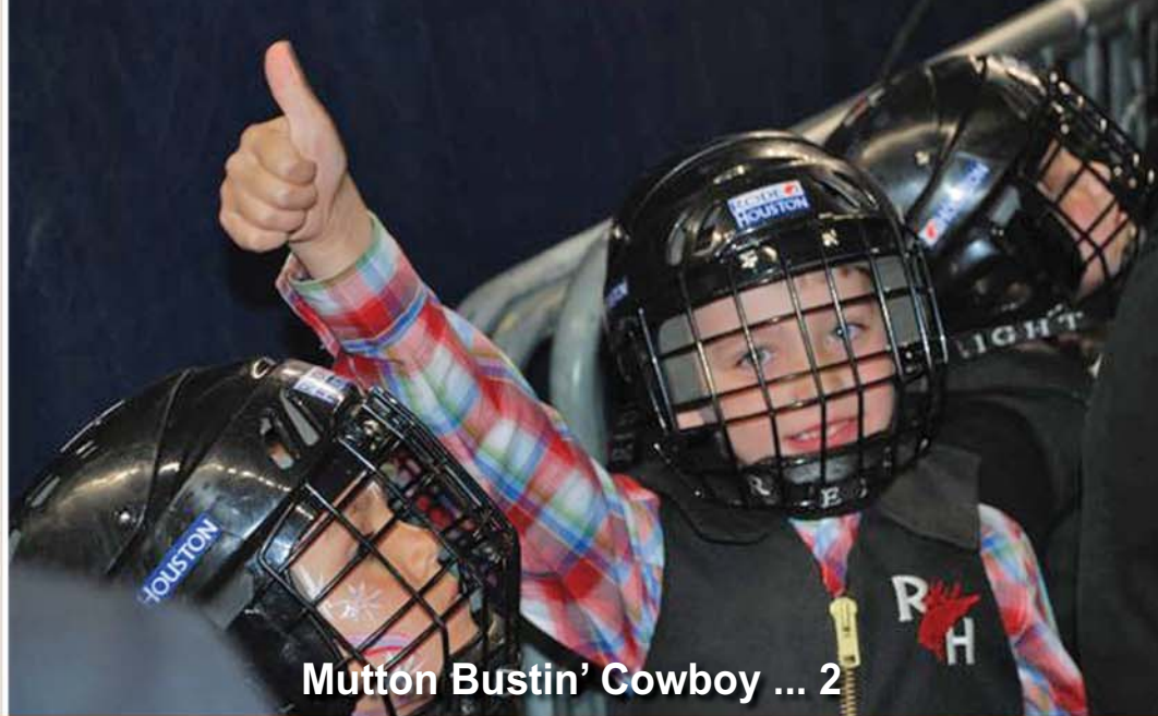
Mutton Bustin' Cowboy ... 2